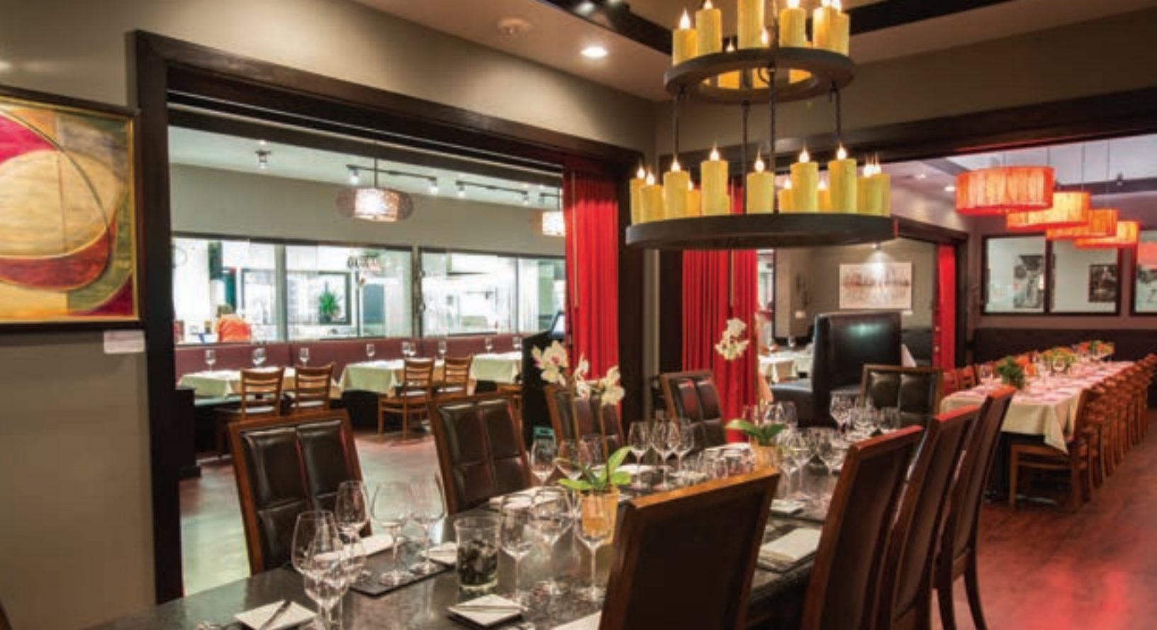
Le Bistro inside the Culinary Institute Lenotre