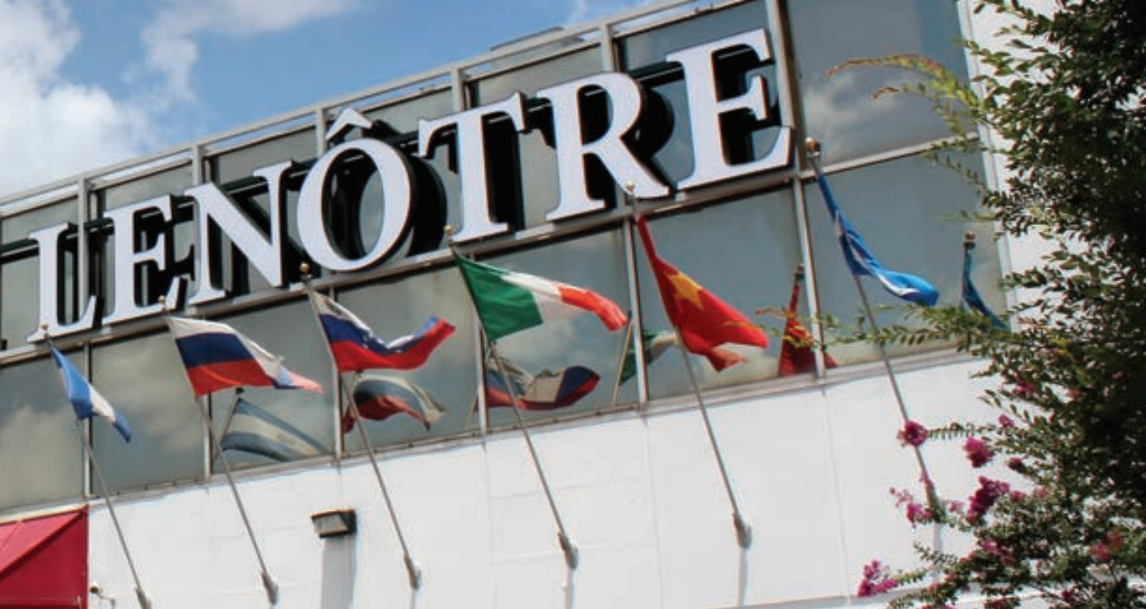
CULINARY INSTITUTE LENOTRE* North Building.