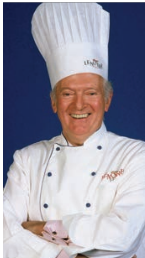
Chef Gaston Lenotre